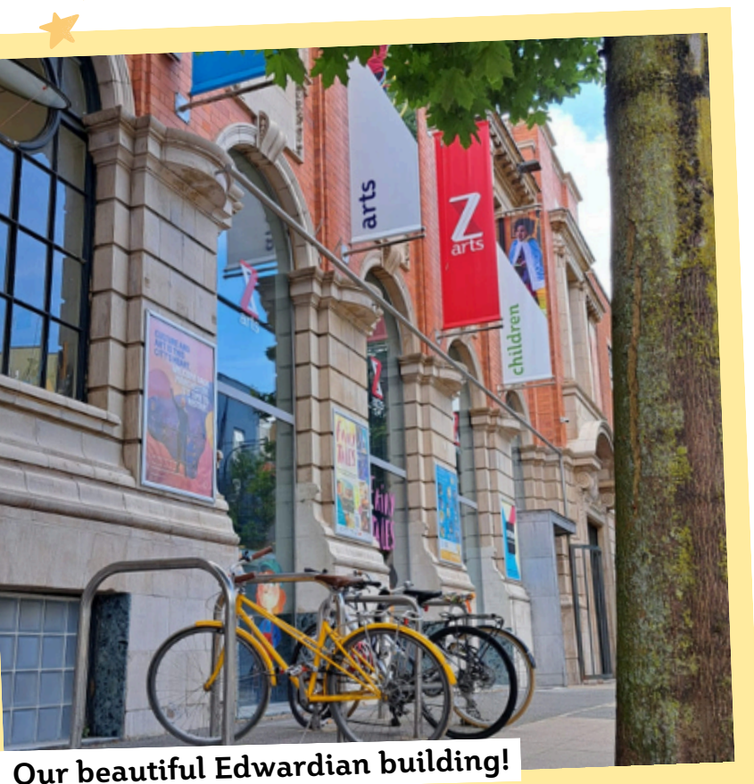
Our beautiful Edwardian building!

We look forward to hearing from you soon!