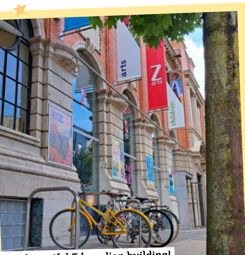
Our beautiful Edwardian building!

We look forward to hearing from you soon!