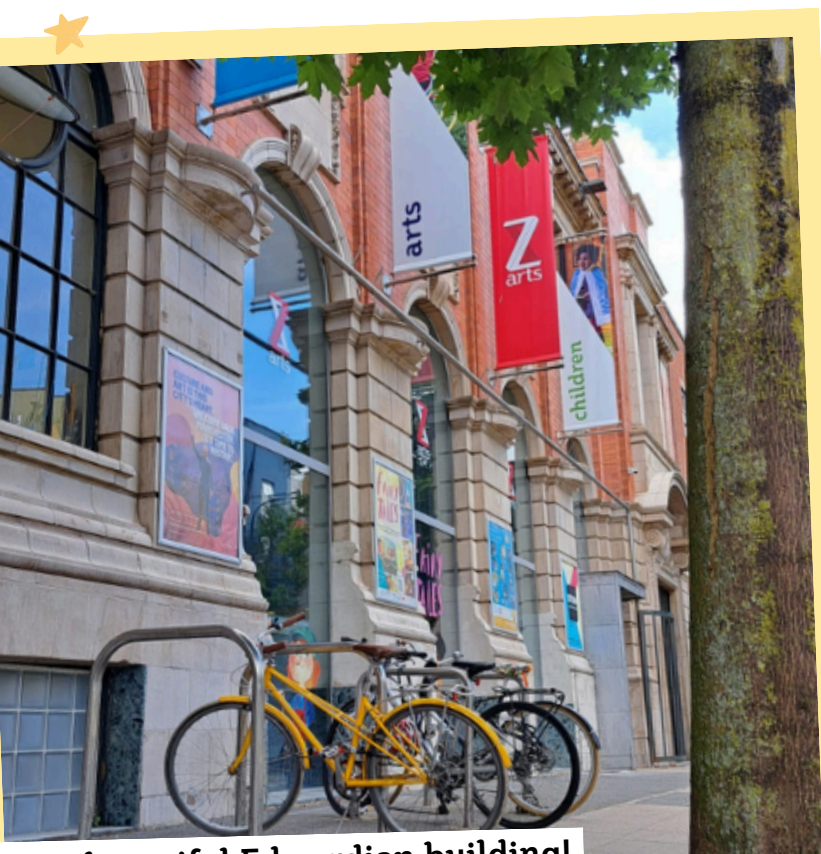
Our beautiful Edwardian building!

We look forward to hearing from you soon!