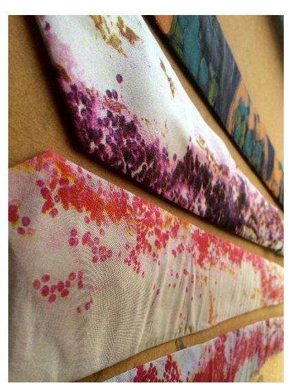
Z-artist Sally Gilford creates textile designs inspired by biology.